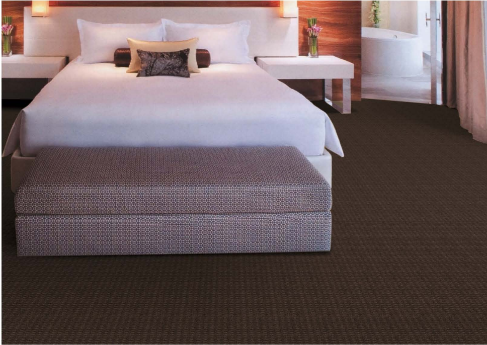
MIXED COFFEE BL05