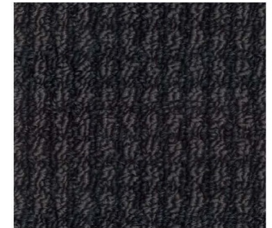
MIXED COFFEE BL05

STYLE NAME: Bali CONSTRUCTION: 1/10" Tufted Loop Pile Graphic FIBRE: 100%BCF Solution 2400 Denier PILE WEIGHT: ca880g/m2 (26oz/y2) TOTAL WEIGHT: ca1900g/m2 (56oz/y2) PILE HEIGHT: ca2mm Low, ca6mm Hight STITCH RATE: 44.5/10cm (11.1 spi) SECONDARY BACKIN ActionBac STANDARD ROLL SIZ13.66x30m