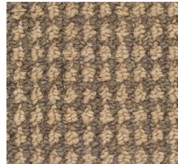
MIXED SAND BL02