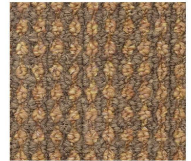
MIXED BROWN BL03