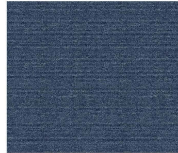
BLUE JAY FP18