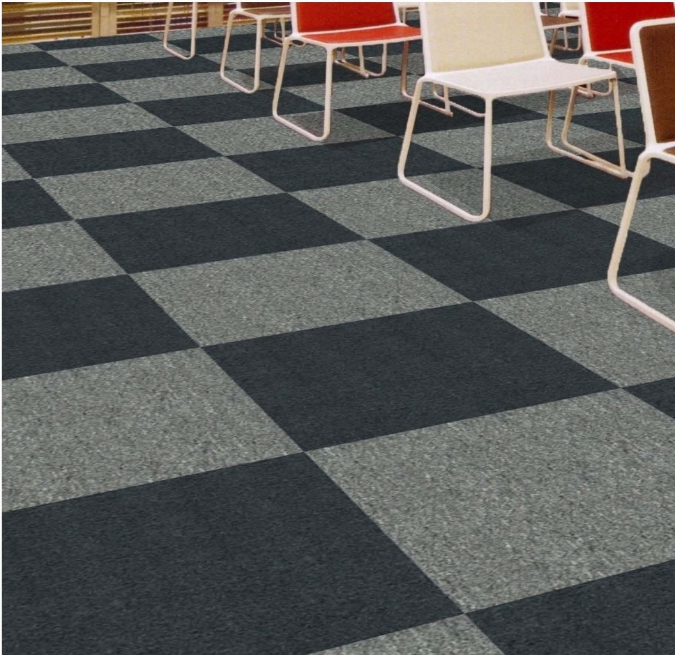
ASH GREY FP12 & CHARCOAL FP17