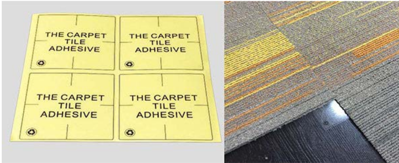
CARPET TILE STICKER (Replacement of adhesive but the sub-floor surface must be flat. Ideal to use on Raised Floor System)