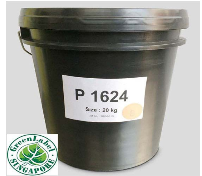
CARPET TILE ADHESIVE (Pressure Sensitive)