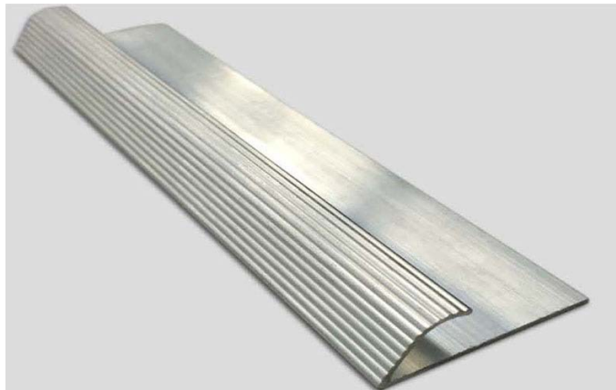
ALUMINIUM CARPET EDGE TRIM