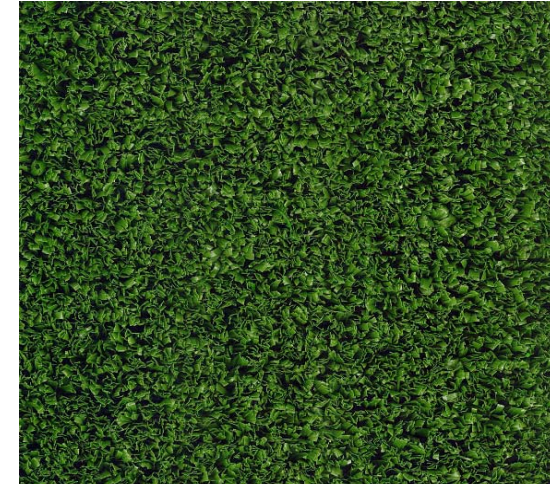
HIGH END GRASS