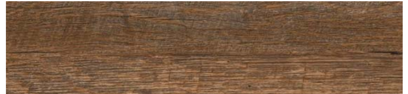
EMBOSSÉD SUMMER LY210