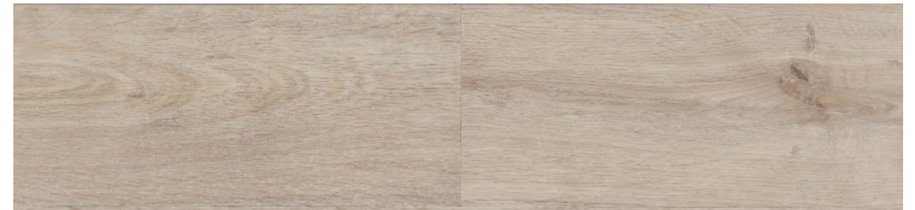
ALMOND CREAM LY716