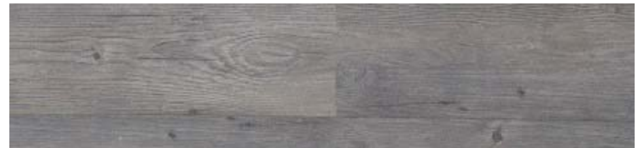
ANTIQUÉ OAK LY234