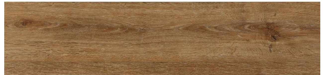
NATURAL WOOD LY788