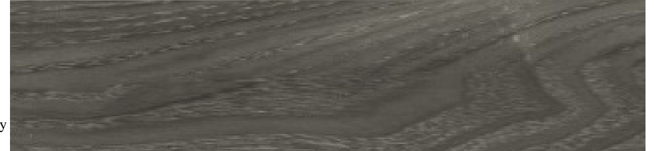
OPAL GREY LY197