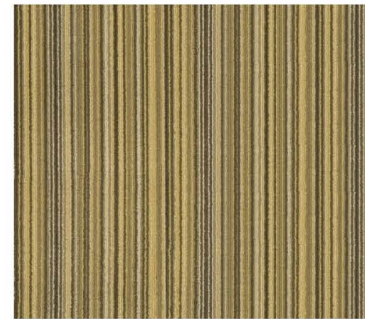
LAND STONE 6E