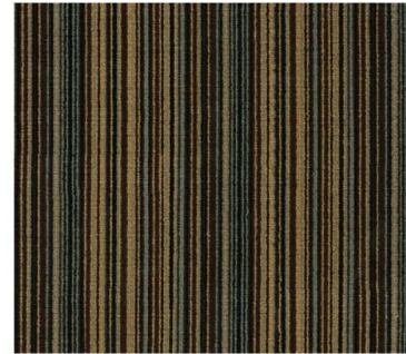
DOWN TO EARTH 6H