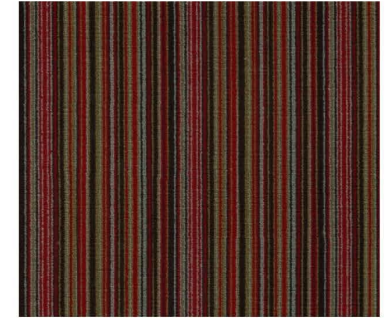
LUCKY CHARM 6G