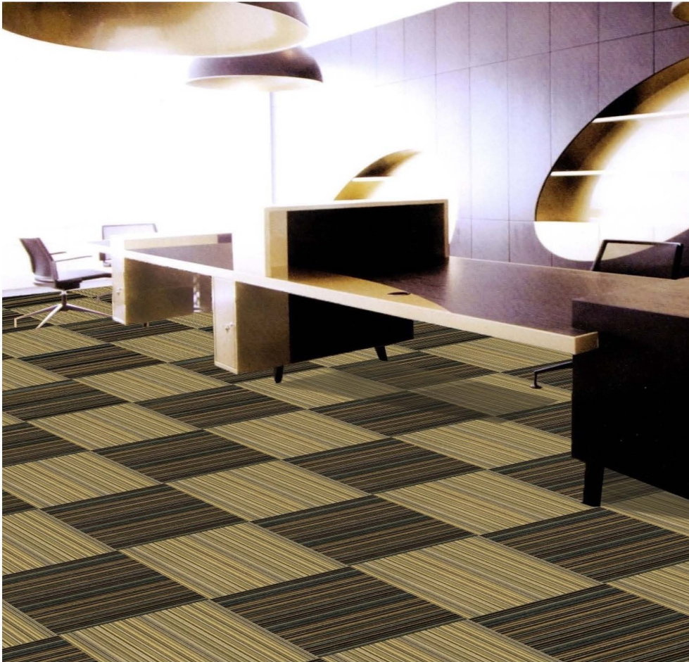
DOWN TO EARTH 6H & LAND STONE 6E