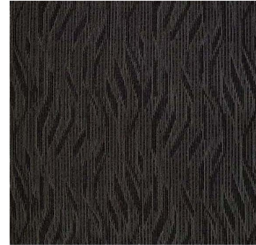
BROWN CHERRY TK03

* AS IN ALL QUALITY CARPETS, COLOURS ARE SUBJECT TO DYELOT VARIATIONS.