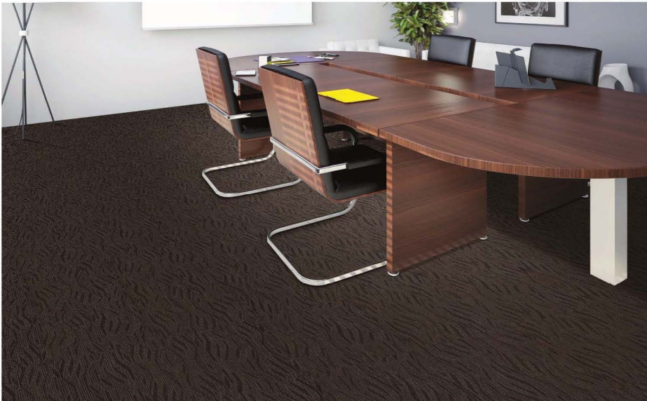
BROWN CHERRY TK03