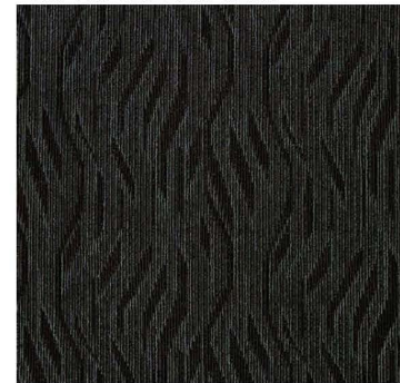
BLACK LILY TK04

STYLE NAME: CONSTRUCTION: YARN: DYED METHOD: GAUGE: PILE HEIGHT: TOTAL THICKNESS: PILE WEIGHT: TOTAL WEIGHT: TILE BACKING: PRIMARY BACKING CLOTH: YARN TREATMENTS: ANTI-SOIL, ANTI-OIL TREATMENT: TILE SIZE: PACKING: PERFORMANCE ELECTROSTATIC PROPENSITY: