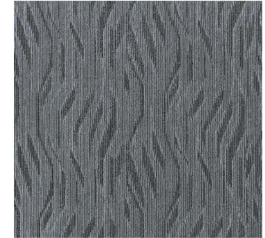
SILVER TULIP TK01