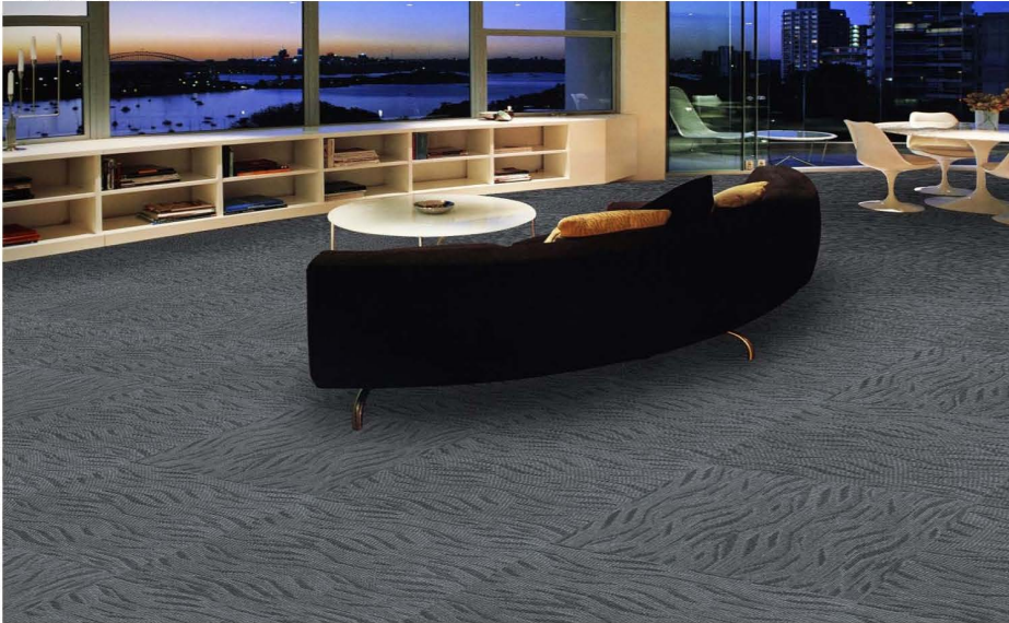
SILVER TULIP TK01